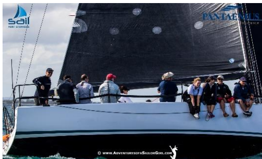
Tempo: Nic Douglas Photo