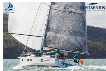
Kayimai

Winners of the Sail Port Stephens Spirit of Port Stephens Trophy for 2019 is the fantastic crew of Mortgage Choice Rumba who were chosen because they embody the spirit of participation and fun - and they are just lovely people! 🏆🍷🍹🔧