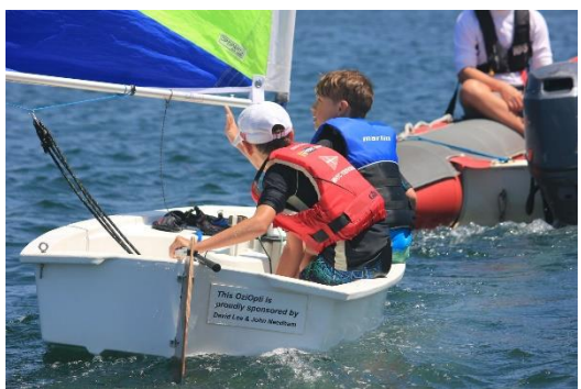
Tackers out sailing