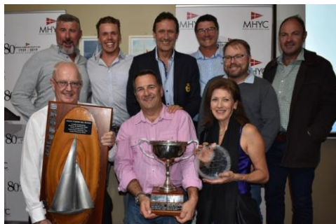
Nine Dragon's crew accepting awards for 1 st in IRC and PHS in Div 1 Ocean Series.