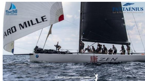
Zen